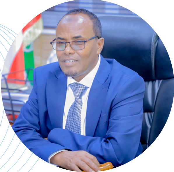
Hon: Abubakar Abdirahman Good

The Ministry of Water Resources has outlined seven national priorities to guide the development of the water sector. These priorities focus on strengthening watershed management and rainwater harvesting, expanding groundwater resources and urban water supply, and improving access to safe water in rural communities.